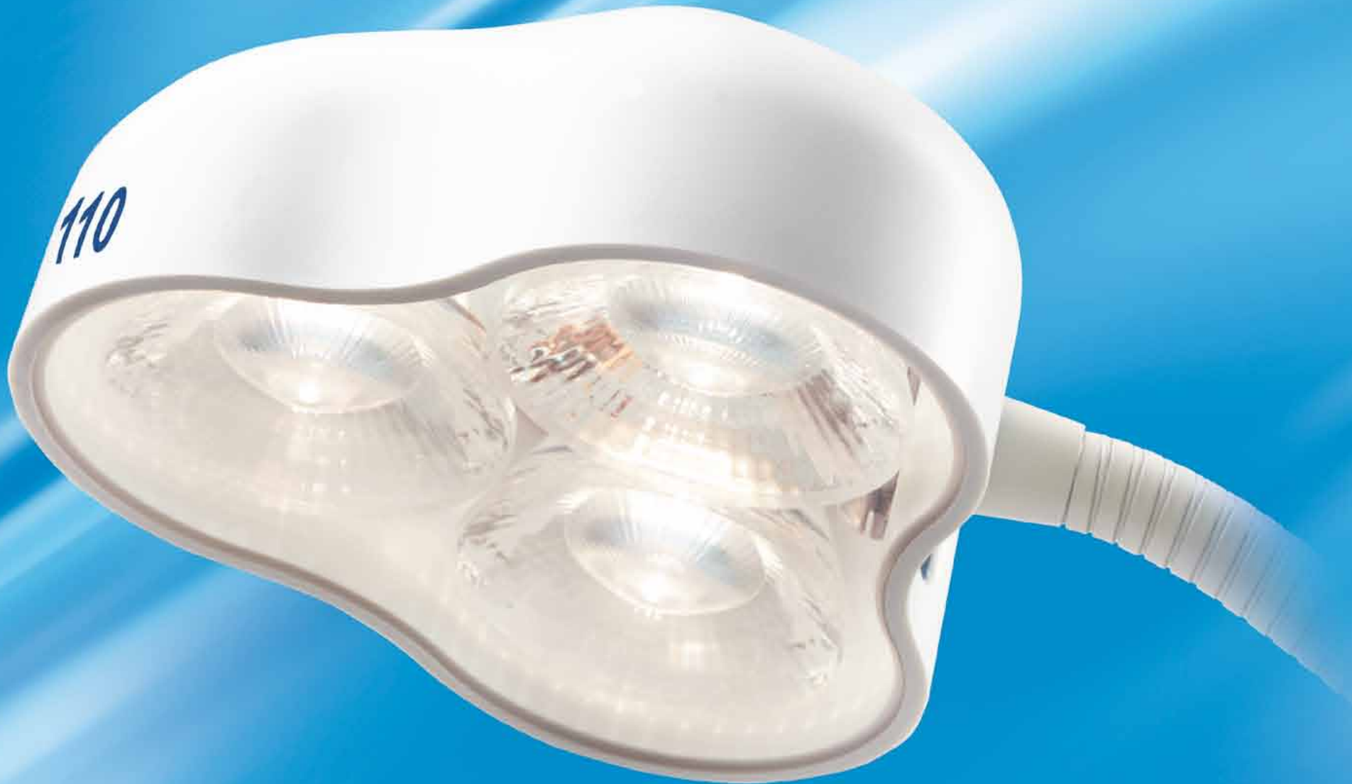
Mach LED 110 35.000 Lux (at 0,5m distance)

Compact examination light with LED-technology for diagnosys and prophylaxis