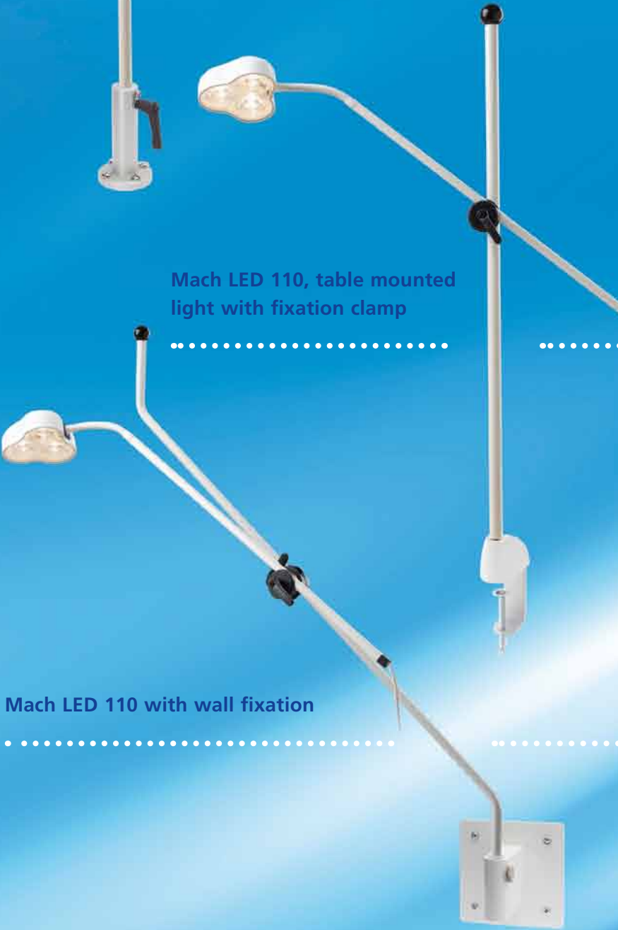
Mach LED 110 with wall fixation